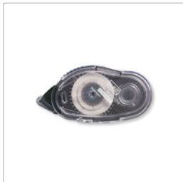
Snail Adhesive - 104332