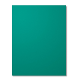
Tranquil Tide 8-1/2" X 11" Cardstock - 144246