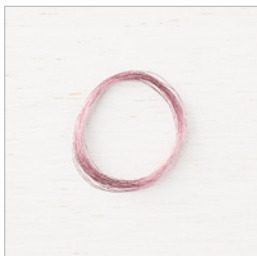
Rose Metallic Thread - 146915