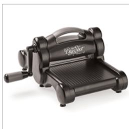
Big Shot - 143263