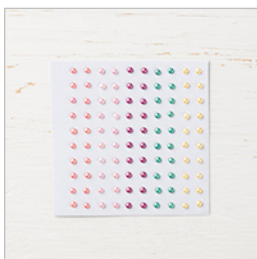
Share What You Love Artisan Pearls - 146927