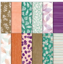
Nature's Poem Designer Series Paper - 146338