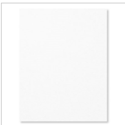
Whisper White 8-1/2" X 11" Cardstock - 100730