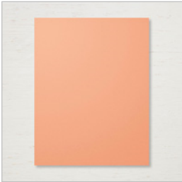
Grapefruit Grove 8-1/2" X 11" Cardstock - 146972