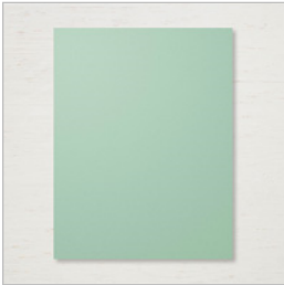
Mint Macaron 8-1/2" X 11" Cardstock - 138337