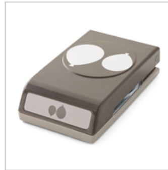
Balloon Bouquet Punch