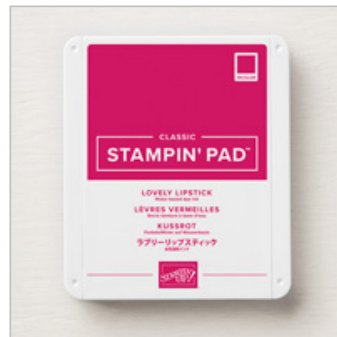
Lovely Lipstick Classic Stampin' Pad 147140 Price: $7.50