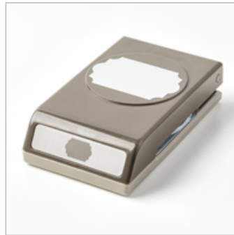
Everyday Label Punch