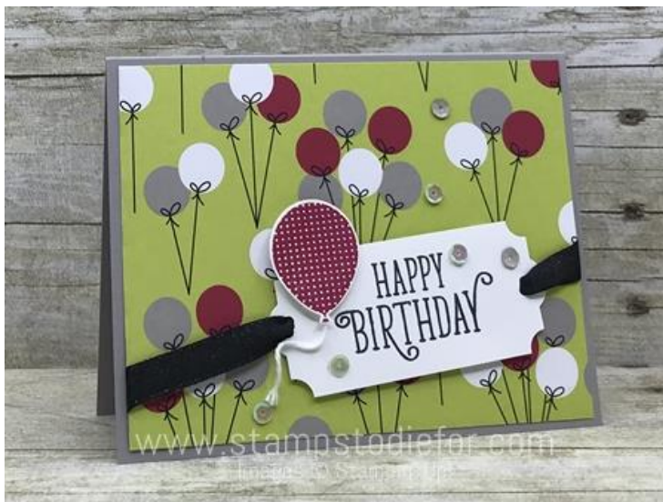
My card CASE from page 77 of the Annual Catalog