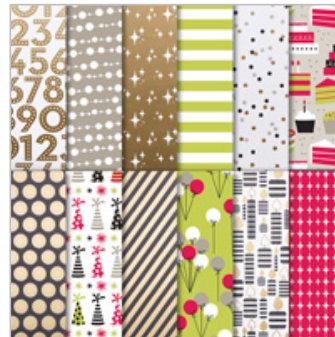
Broadway Bound Specialty Designer Series Paper 146277 Price: $14.00