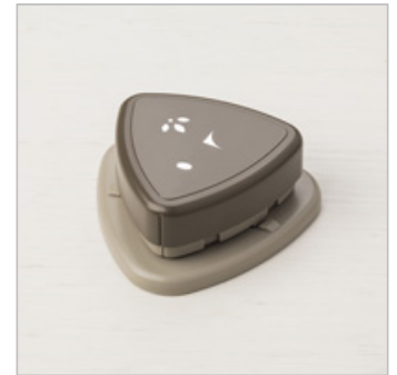
Detailed Trio Punch