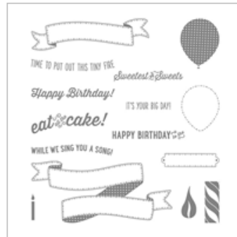
Birthday Banners Photopolymer Stamp Set 141506 Price: $17.00