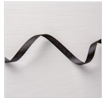
Basic Black 3/8" Shimmer Ribbon 144129 Price: $7.00