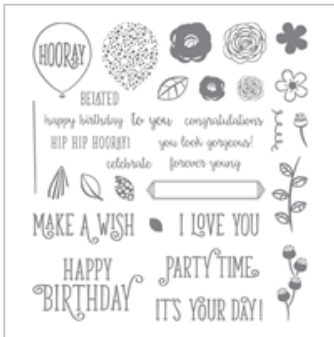
Happy Birthday Gorgeous Photopolymer Stamp Set 143662 Price: $21.00