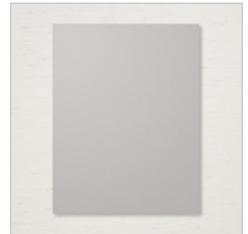
Gray Granite 8-1/2" X 11" Cardstock 146983 Price: $8.50