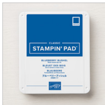
Blueberry Bushel Classic Stampin' Pad