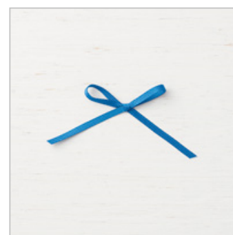
Blueberry Bushel 1/8" (3.2 Mm) Grosgrain