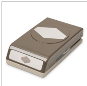
Tailored Tag Punch