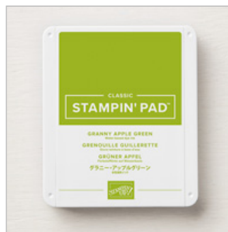
Granny Apple Green Stampin' Pad