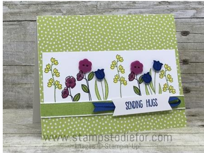
Card CASE from pg. 61 of the Annual Catalog