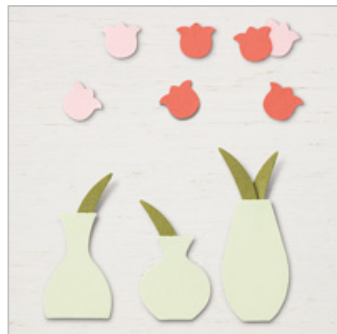
Vases Builder Punch