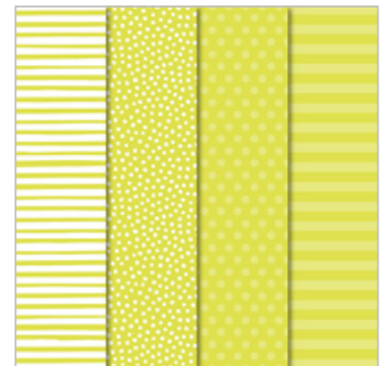
In Color 2017-2019 6" X 6" (15.2 X 15.2 Cm) Designer Series