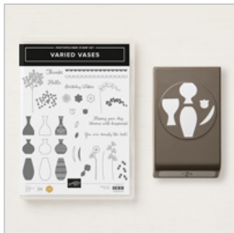
Varied Vases Photopolymer Bundle