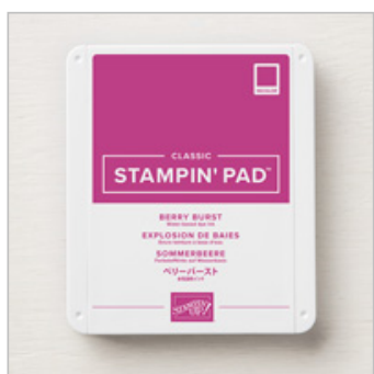
Berry Burst Classic Stampin' Pad