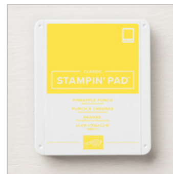
Pineapple Punch Classic Stampin' Pad