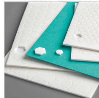
Mini Stampin' Dimensionals