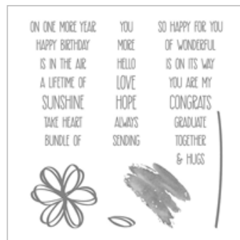
Sunshine Sayings Clear-Mount Stamp