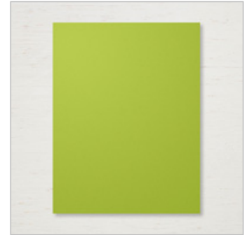
Granny Apple Green 8-1/2" X 11" Cardstock