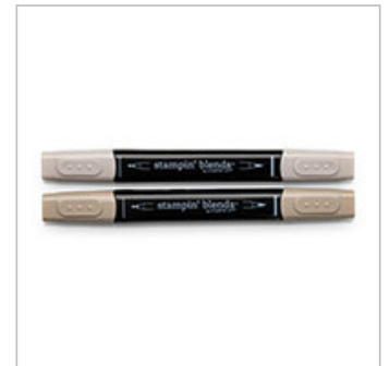
Crumb Cake Stampin' Blends Markers Combo Pack