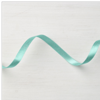
Pool Party 3/8\"/> Shimmer Ribbon