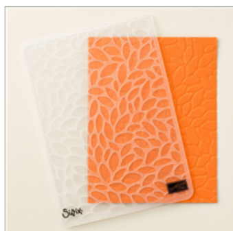
Petal Burst Textured Impressions Embossing Folder