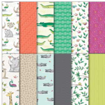
Animal Expedition Designer Series Paper