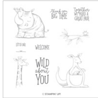
Animal Outing Clear-Mount Stamp Set