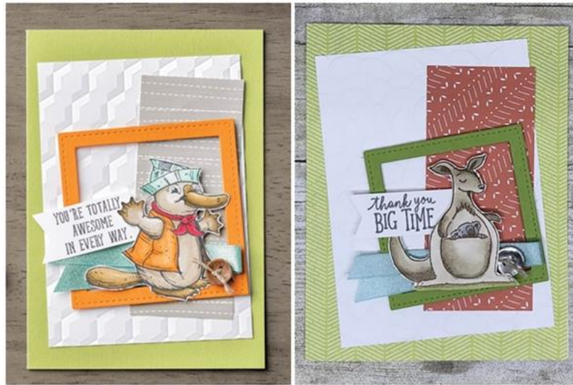
CASE (copy and selectively edit) page 48 Annual Catalog