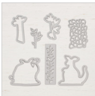
Animal Friends Thinlits Dies