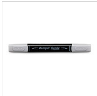
Smoky Slate Light Stampin' Blends Marker