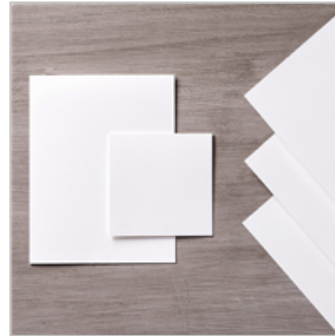
Whisper White 8-1/2" X 11" Thick Cardstock