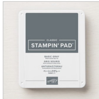
Basic Gray Classic Stampin' Pad