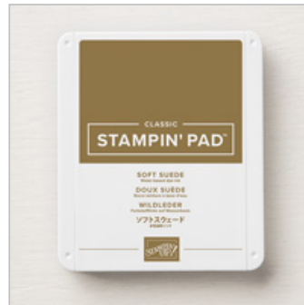
Soft Suede Classic Stampin' Pad