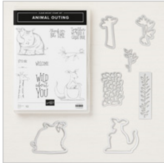
Animal Outing Clear-Mount Bundle