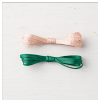
Metallic Ribbon Combo Pack