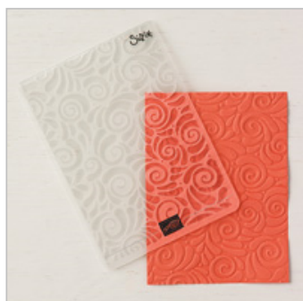
Swirls & Curls Textured Impressions Embossing Folder