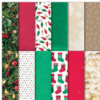
All Is Bright 12" X 12" (30.5 X 30.5 Cm)