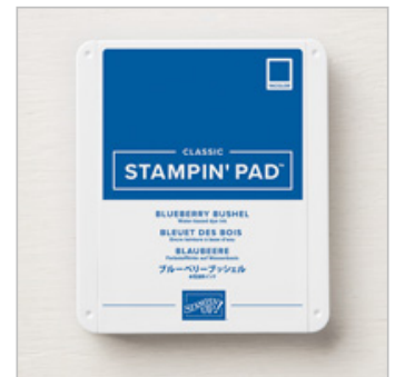
Blueberry Bushel Classic Stampin' Pad