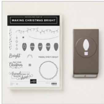
Making Christmas Bright Photopolymer