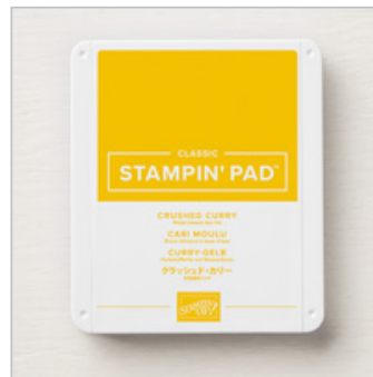
Crushed Curry Classic Stampin' Pad