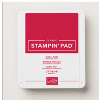
Real Red Classic Stampin' Pad