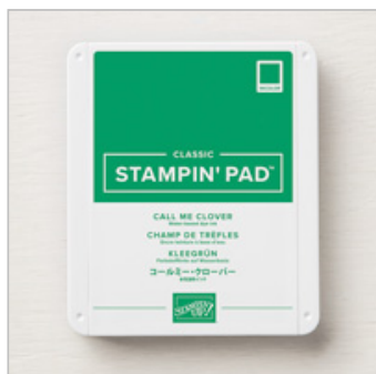
Call Me Clover Stampin' Pad