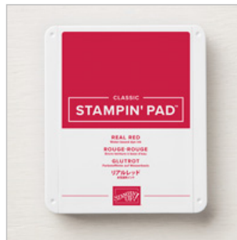
Real Red Classic Stampin' Pad