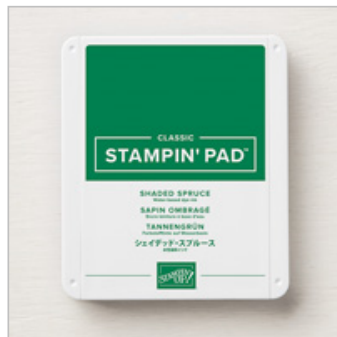
Shaded Spruce Classic Stampin' Pad