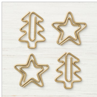
All Is Bright Paper Clips