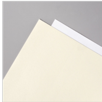
Very Vanilla 8-1/2" X 11" Thick Cardstock